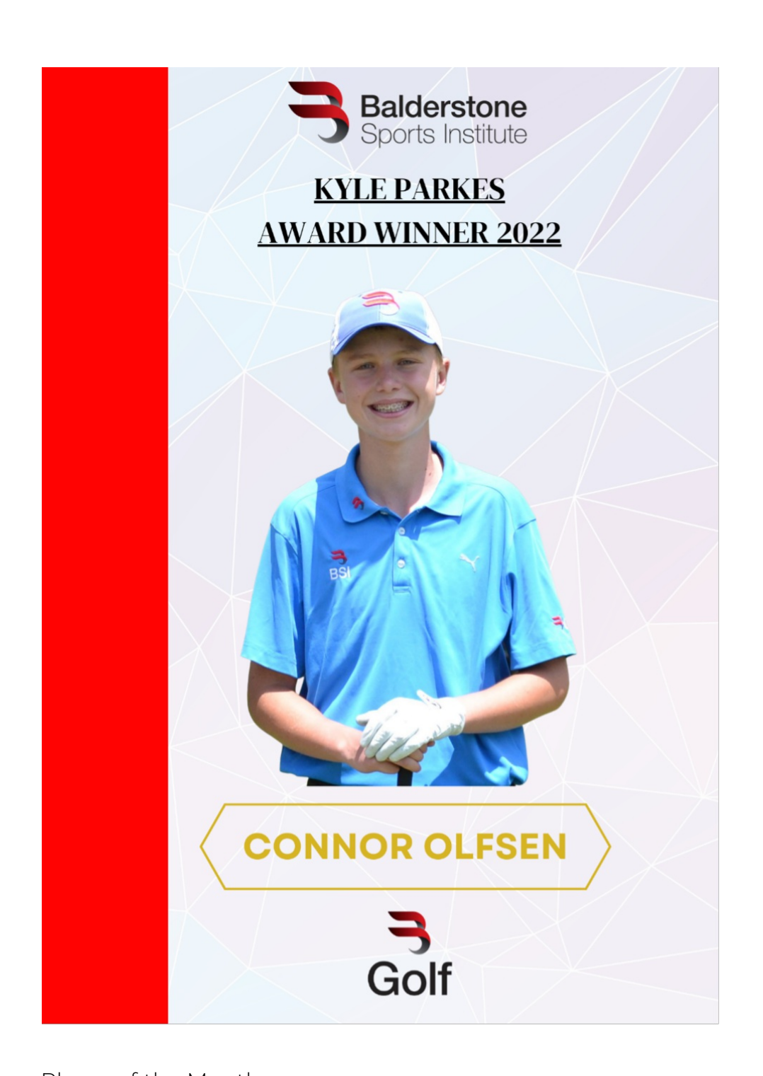
Player of the Month