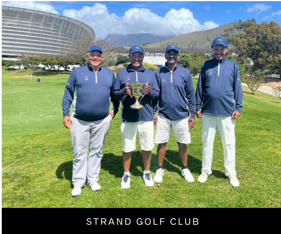
STRAND GOLF CLUB

Congratulations to the Strand Golf Club caddie team on winning the 2022 Caddie League season on a score of 736 points.