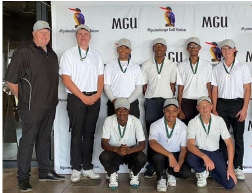
Central Gauteng Golf Union U17 Team