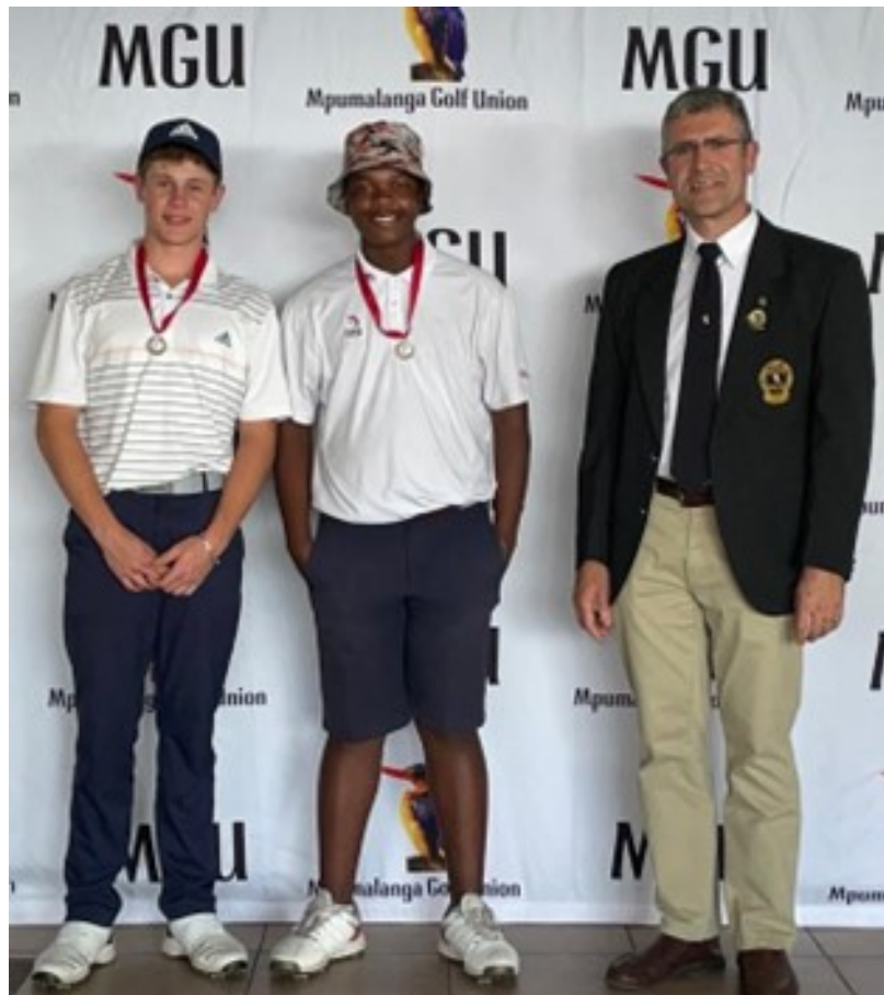
North West Golf Union U19 Team