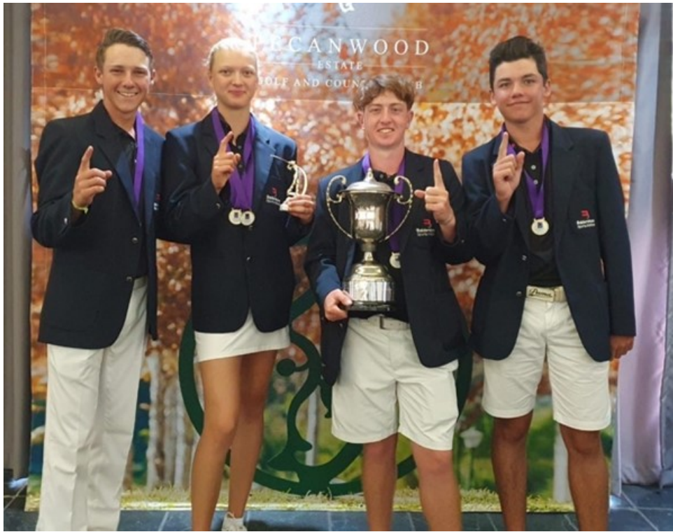
Team BSI 2020