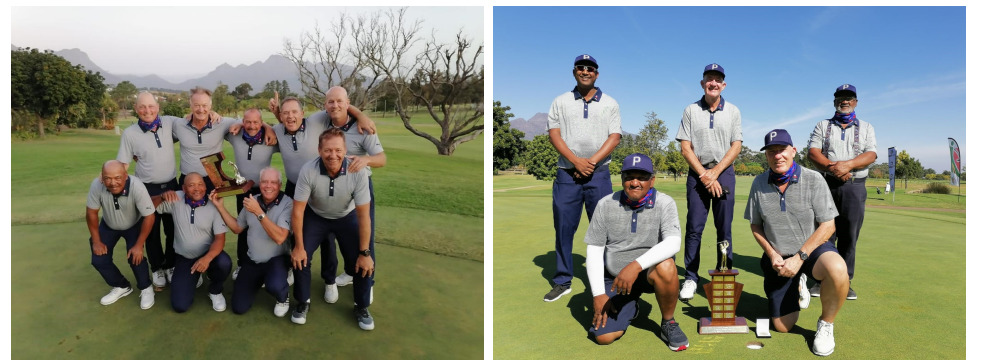
April - Senior and Super Senior IPT