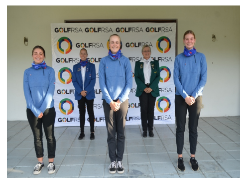
May – Women's 72 Hole Teams Championships