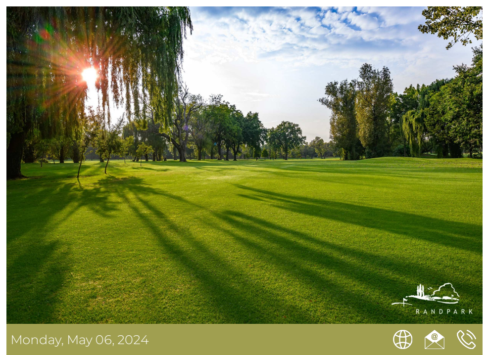
View online | Download a printer friendly copy