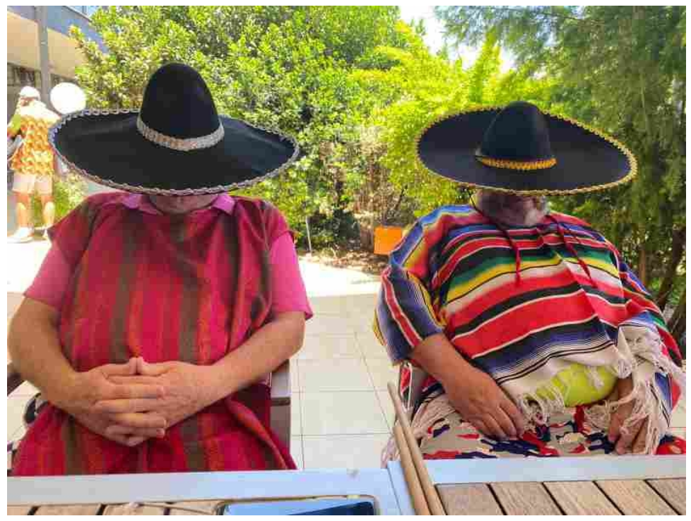
And it all got a bit too much for the Mexican Team!

During this time of the year, we normally have late afternoon storms, and we would like to remind our members to please take extra care in case of lightning. If you hear the warning siren (30 second siren,) the competition will be suspended immediately. The manager/committee member on duty will analyse the weather pattern and will determine the outcome of the competition. Players that continue to play will not be eligible to compete in the competition.