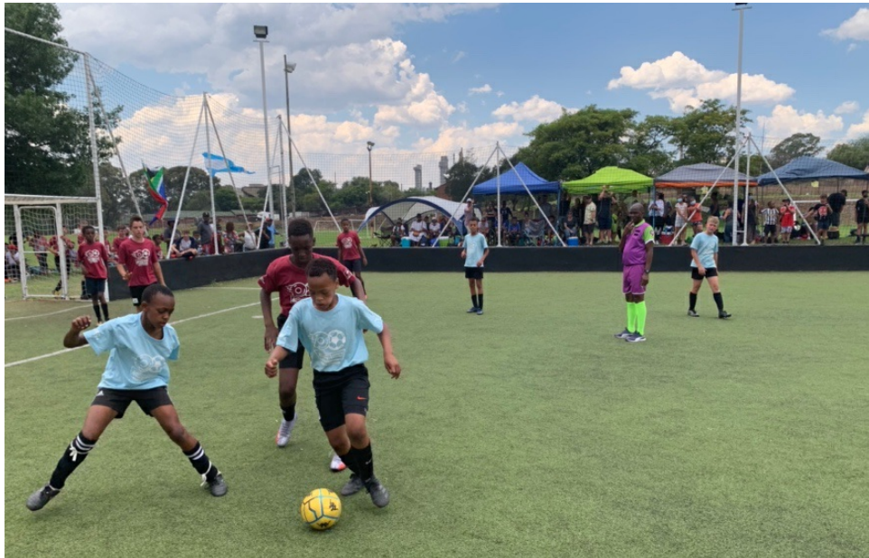
Family fun and strong competition

It was a wonderful family atmosphere, with around 150 spectators enjoying the matches and a great vibe with music, food and refreshments.