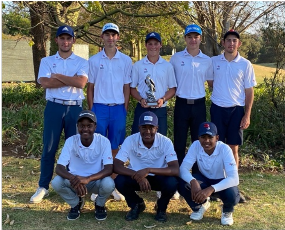
BSI Team Challenge Winners – BSI Junior Academy

These Juniors truly look like they are loving their golf, and we see this every day in what they do and bring to the classroom and it shows through on the course with their results as individuals and as team players. And we cannot mention enough times what a great bunch of gentlemen this group is producing.