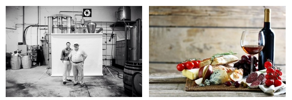
Dalla Cia...It all began in Friuli, Northern Italy, in the 1920s...

Due to the current level 3 restrictions and the idea to create a wonderful Italian themed evening with good food paired with the famous Dalla Cia wines, we would like to postpone this exciting event. We will be sending out a new date soonest. Watch this space.