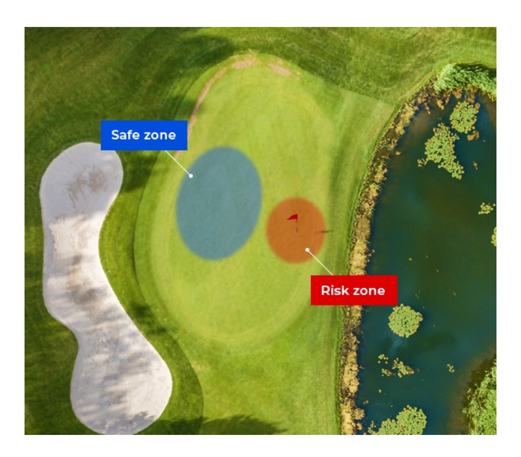
Step 3: Remove the risk

Very often, going for the flag on a par 3 increases risk. In this example, a slight miss when going for the flag puts you in the water hazard. It's an all or nothing shot. But, if you aim for the larger area in the middle of the green, you're only risking an up and down if you go long or fall short.