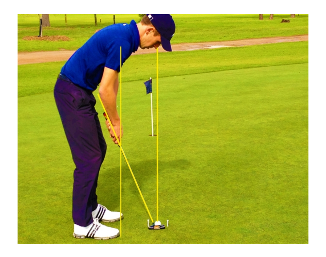
To get into the position above, perfectly aligned, on a consistent basis while feeling comfortable and relaxed, you do need a putter length that is right for you. A putter length not matched to you, will make putting more difficult.