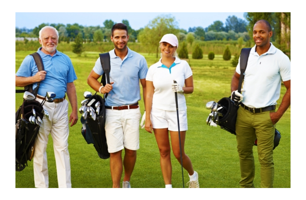
It's pretty obvious that in this fourball, there isn't going to be a one length fits all putter. Giving you the average length of the putter on tour is also meaningless. You are the only thing that matters.