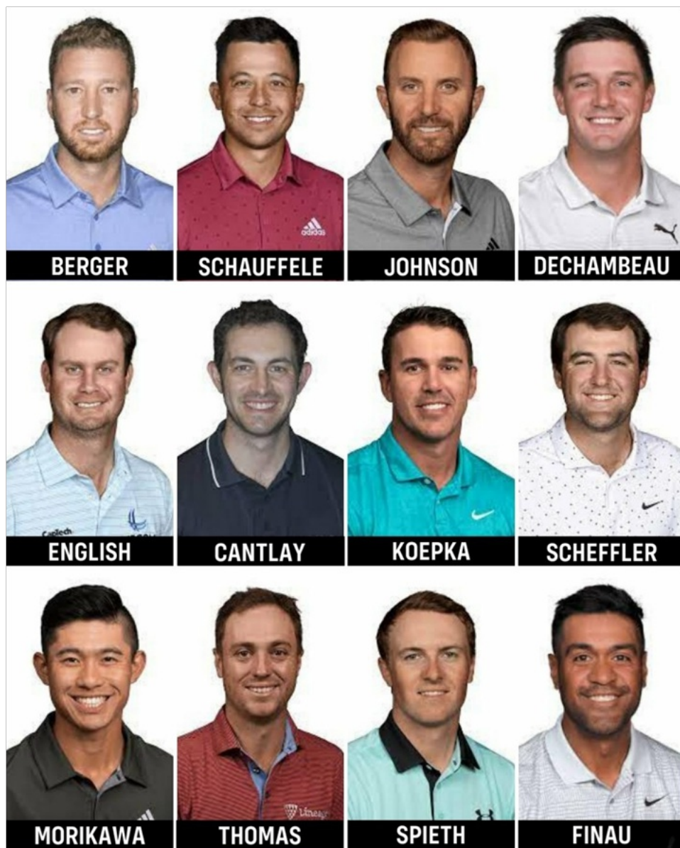
Steve Stricker's Team USA