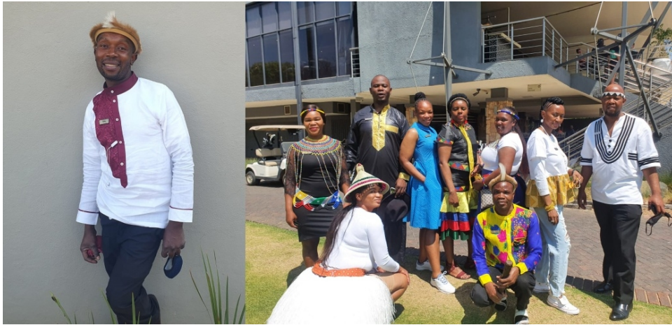
Randpark staff enjoying the Heritage Day celebrations

Click here to BOOK your Fourball, or to SPONSOR a Hole.