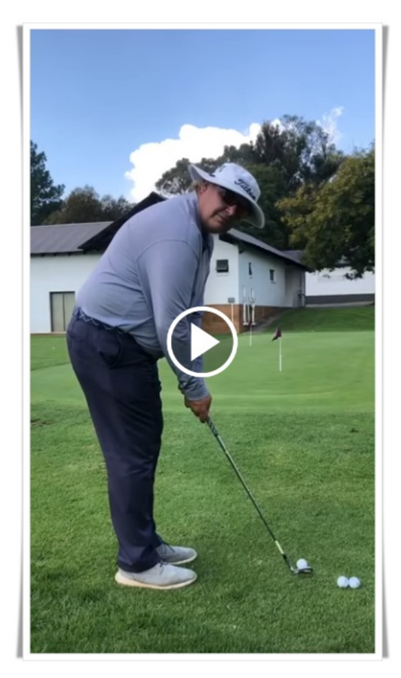
Tell us about your improvement

Did you find this tip helpful? We would love to hear your feedback. Let us know in the link below.