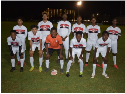
Senior League 2nd Team