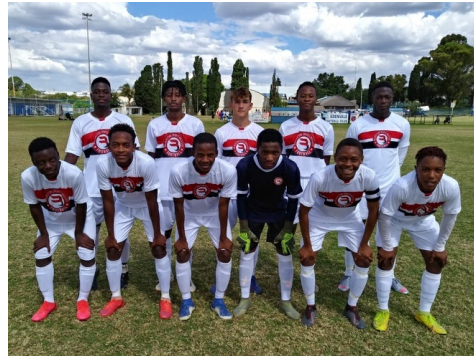
Senior League 1st Team