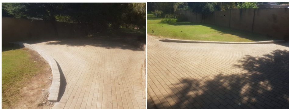
Extension of no. 4 Bushwillow turning circle