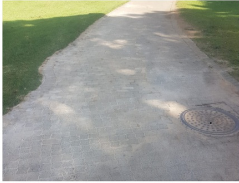
9th Firethorn paving levelled