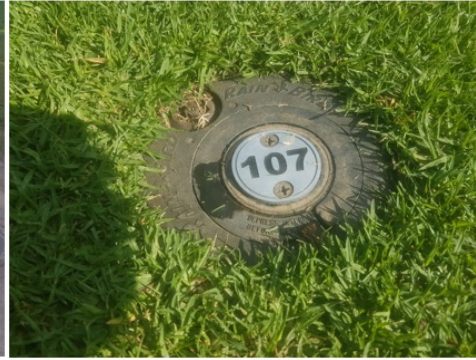
New distance markers Firethorn. Still waiting for small-sized discs that fit on 7th Firethorn and Bushwillow