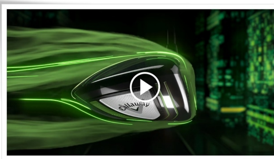
EPIC Driver Line