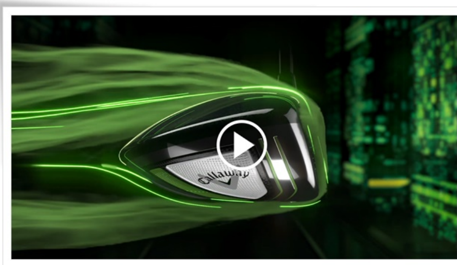
EPIC Driver Line

Hitting it long is definitely fun, but hitting it close to the hole is still what brings home the victories. The APEX 21 irons are so beautiful and with their soft forged feel they give you great distance and forgiving in an amazing looking club head. This year the APEX 21 line has the APEX Pro (will be in both Ryan and Dustin's bag) the standard APEX (our most popular iron for the last 5 years in a row) and the new APEX DCB (stands for Deep Cavity Back and is the most forging APEX ever).