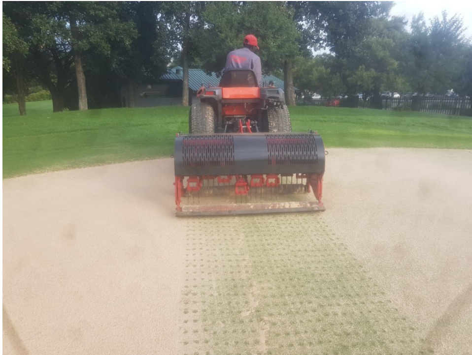
The course team Verti-draining Bushwillow greens