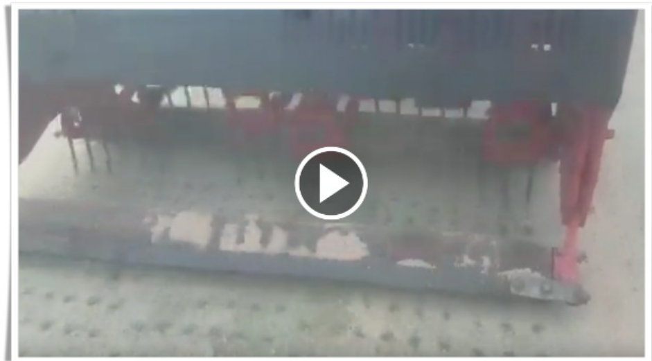
Machine in action on Bushwillow greens

Click here to view a quick 30 second video on the Verti-drain process and importance of aeration.