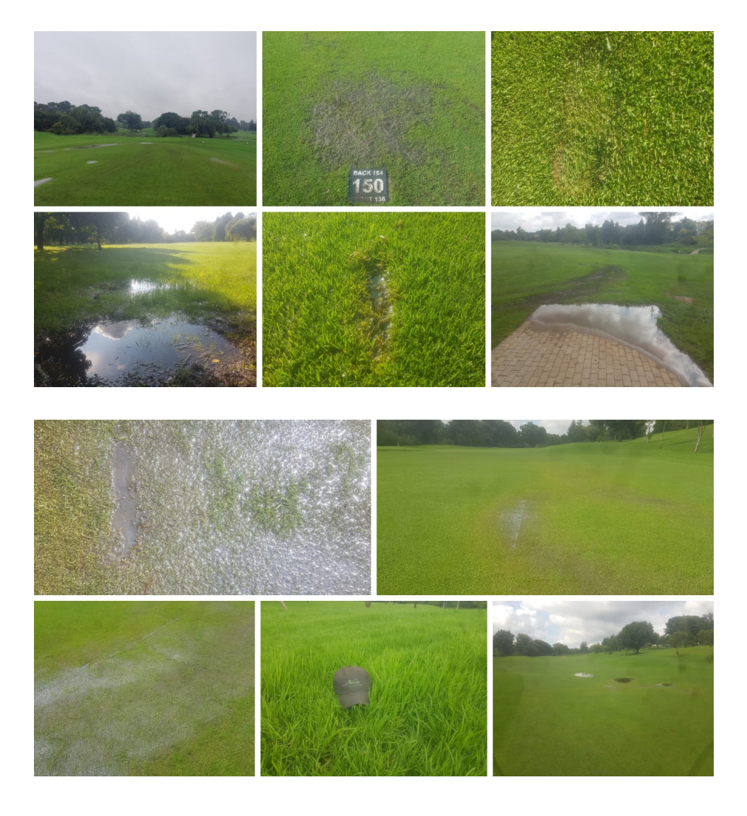
FIRETHORN'S 18th HOLE THE VERY BEST, SAYS

If a course has had heavy play, the damage won't be repaired any time soon. It's very similar to frost. You could walk out on a golf course and see there's no frost. It could be frozen, though, but you can't see it. Rain is the same. It will start drying out from the top but it doesn't mean that a couple of inches under it isn't still soaking wet. That causes compaction.