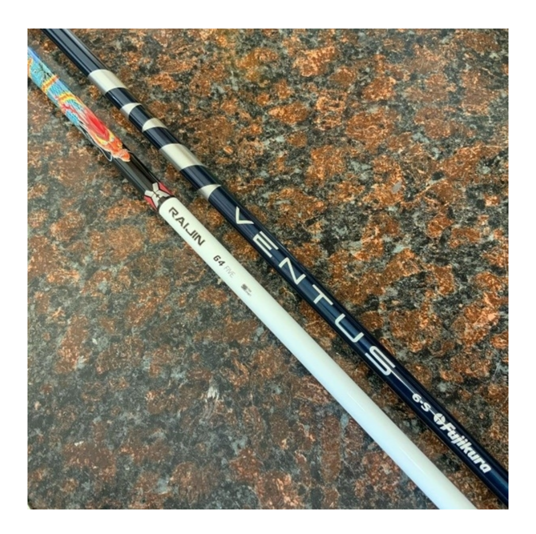
V.A. Composites Rajin and Fujikura Golf Ventus (Blue) shafts, and we're dying to hear how they're performing. The Rajin is a high launch-low spin shaft, and the Ventus is mid-launch and spin.