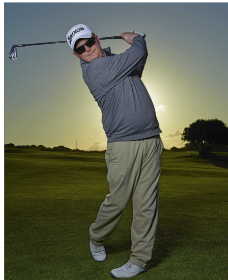
TK, TK, TK