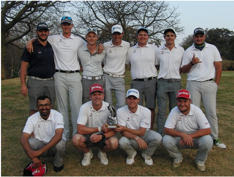
Team Challenge Champions