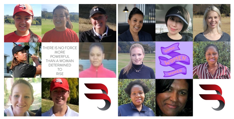
Our female students