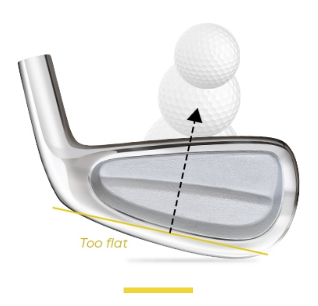
That means the spin axis of the ball becomes tilted. The ball goes right.

One of the challenges too many golfers have is an iron fitted incorrectly. The incorrect lie angle causes the face angle to twist as the toe hits the turf first.