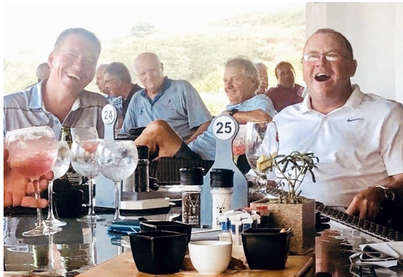
You scored what?