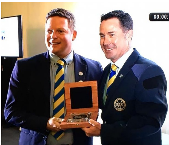
PGA Professional of the Year