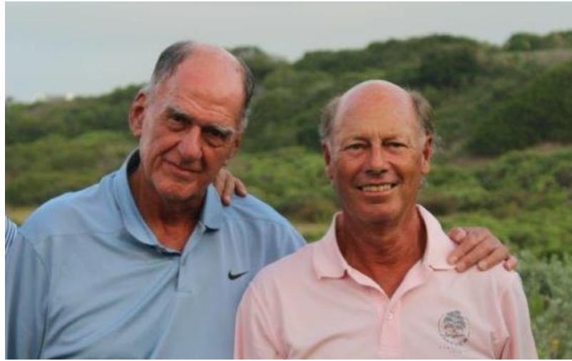
All in a day's work