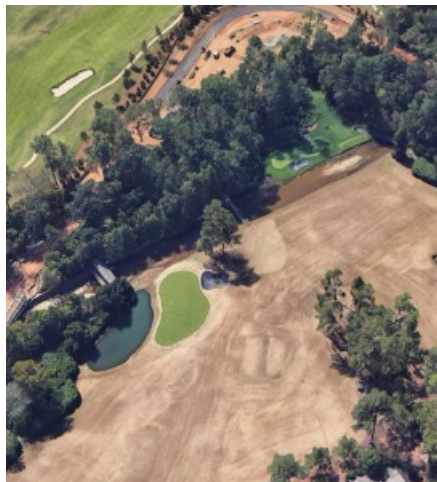
Additional land behind 13

The folks from Augusta sweetened the coffers at Augusta GC when they purchased some more land from their neighbours. The Google Earth photos of a dormant Augusta National reveal an additional piece of land at the top of the left-hand picture. From what appears to be a new tee complex, the carry can now be as much as 340 yards.