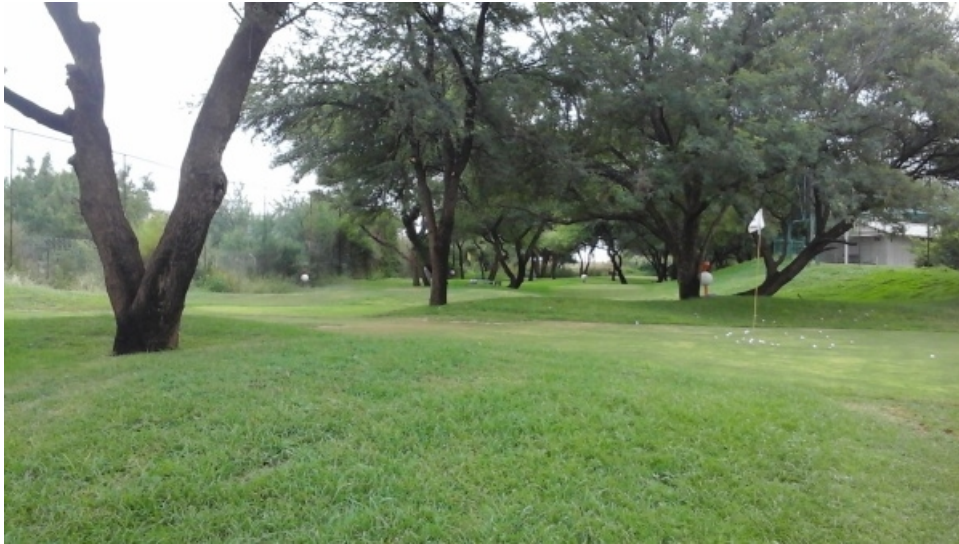
9-hole short game mashie course now open