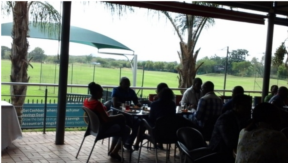
Conference guests enjoying their meal on the terrace with a beautiful view overlooking the range