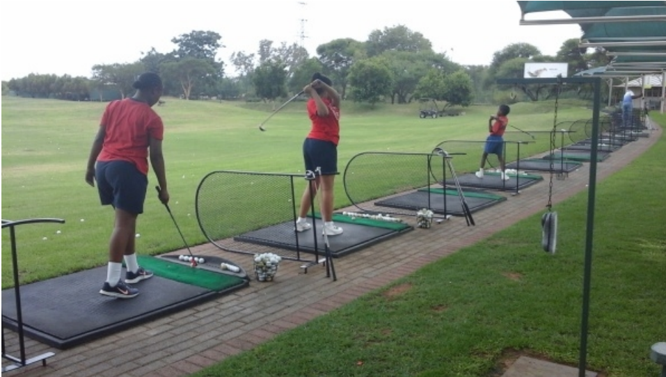
Our Junior Golf members enjoying an afternoon hitting balls after school