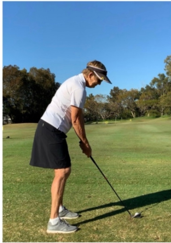
Behind position down the line towards target