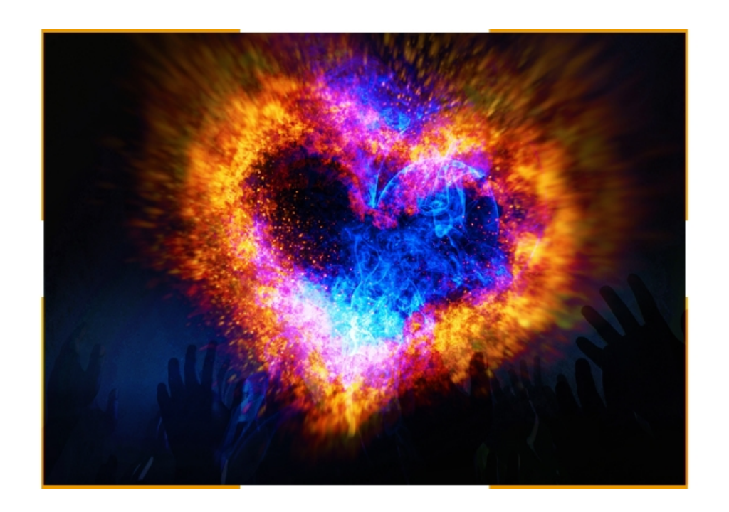
If we want to sustain hope; if we want our flame of desire to burn bright, then we need to <u>take action</u>. We must <u>take action</u>.