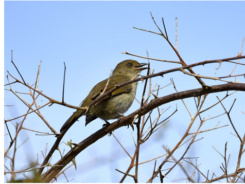
Sombre Bulbul (juv)