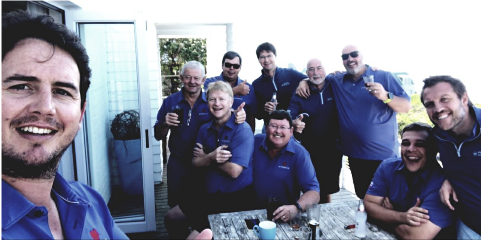
Spending time with a "special" group of people...