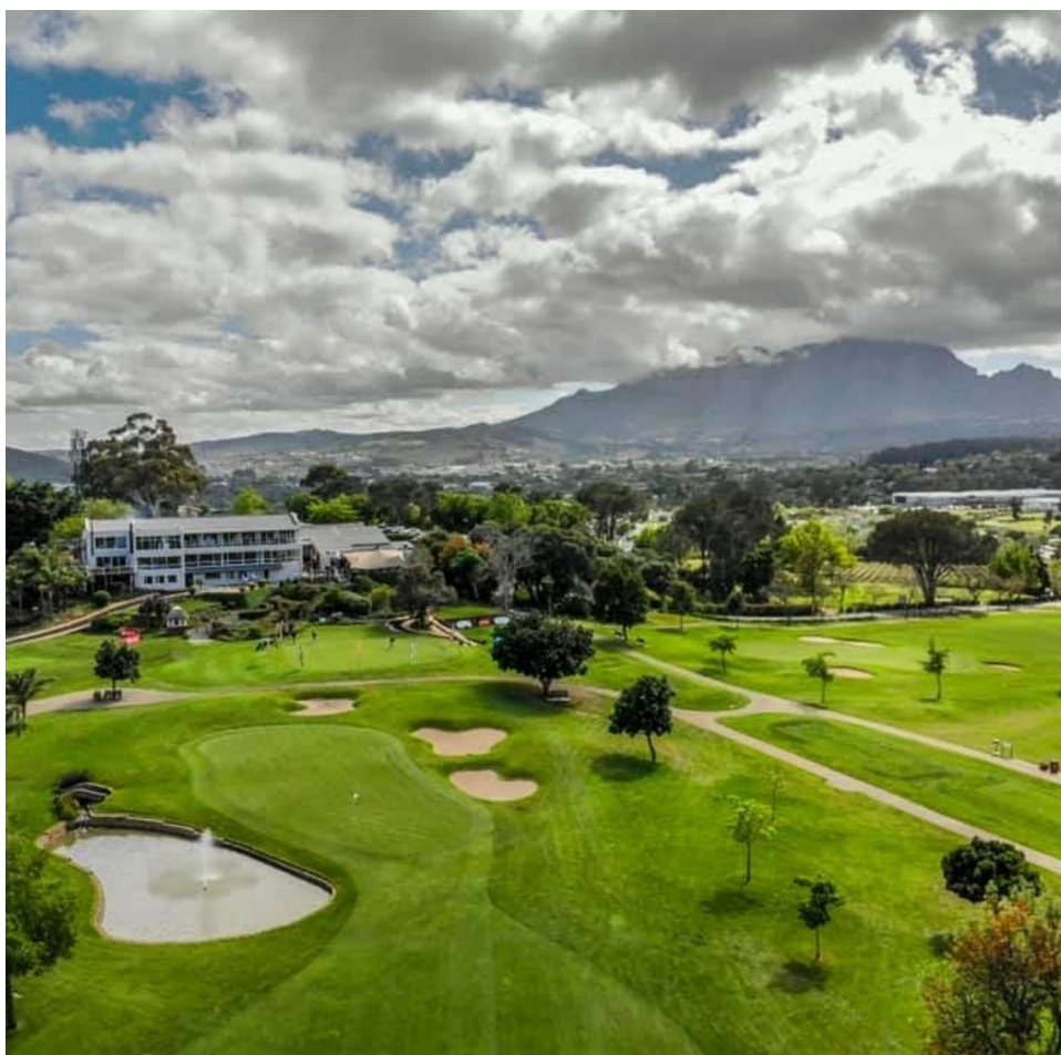
Stellenbosch GC showing off