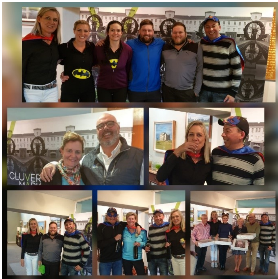
All smiles from our superheroes