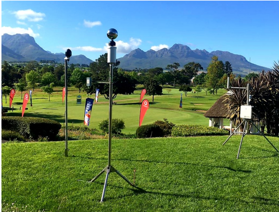
Weather stations during the VOG tournament