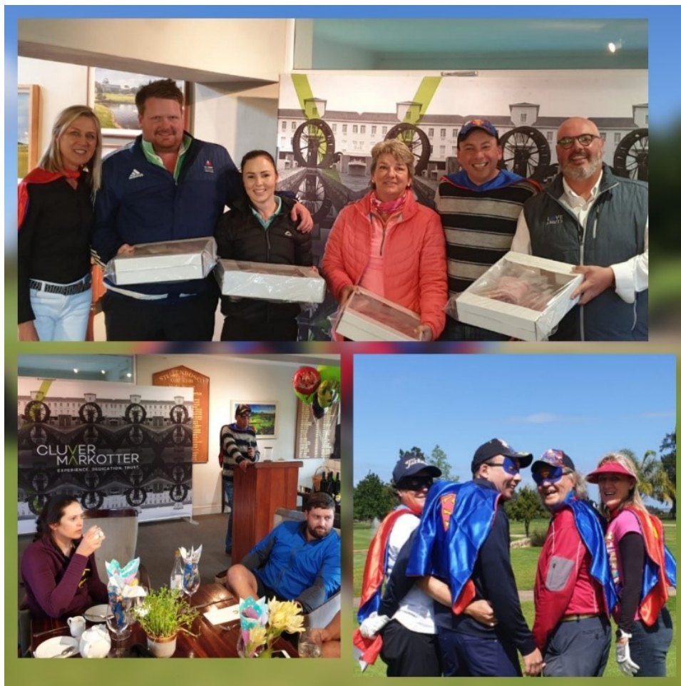
Loved Superman & Superwoman