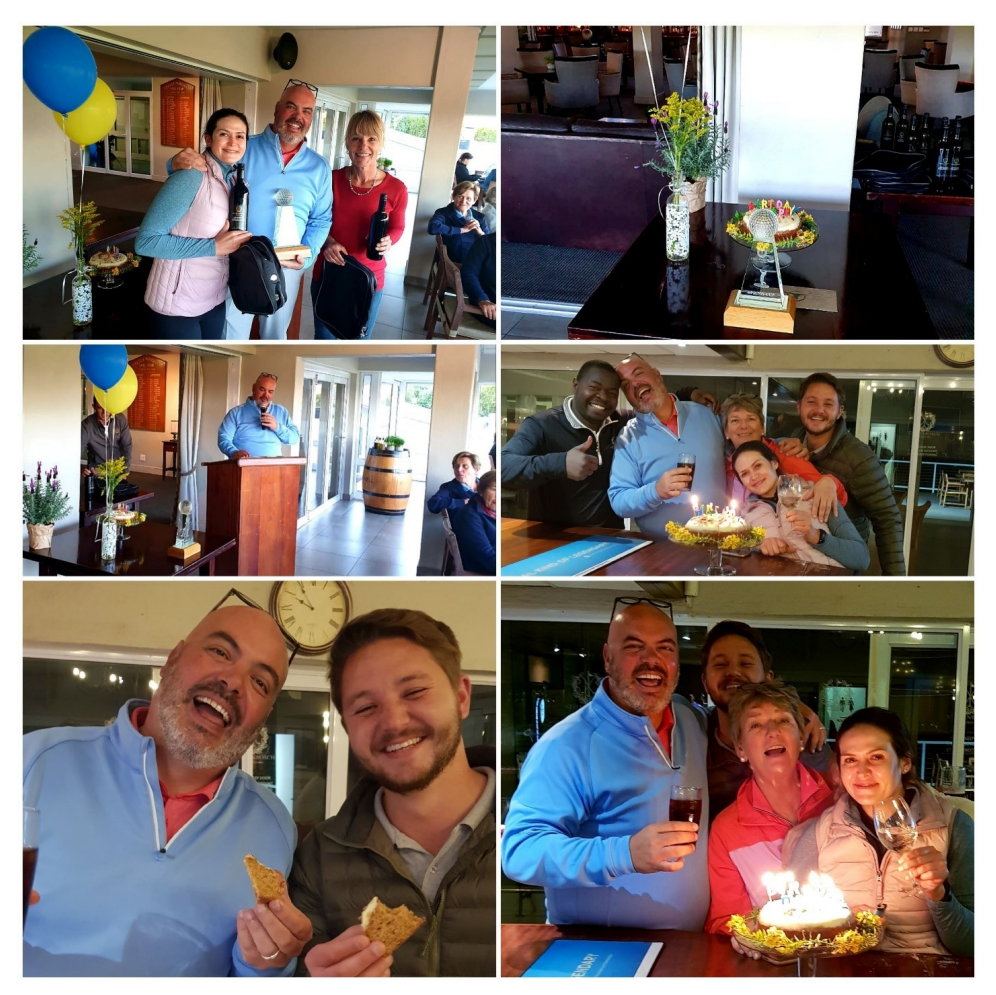
Living the dream with the ladies!

Have a super weekend, it's almost time to support the Bokke as the play Japan and tomorrow we will enjoy the Currie Cup Final. The last time Transvaal played the Free State was in 2007, the Free State won and later that year South Africa was crowned the Rugby World Champions!