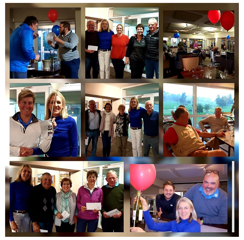
A great day in Mother Russia for our August Mix competition!