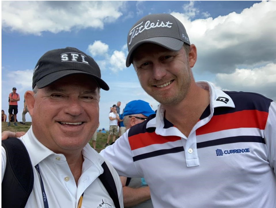
Everyone smiles when they get their picture taken with Santa Clause...

Yesterday it was smiles, smiles all around and we all loved it from the kids to the parents. I can go on and on about yesterday but I'm not going to, all I'll say is don't miss out on the next one if you missed yesterday's introduction – well done to all the kids! I'm still smiling today and can't wait to see you all again. #target36