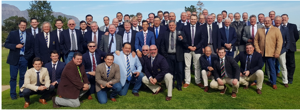
The Honourable Gentleman of Stellenbosch 2019