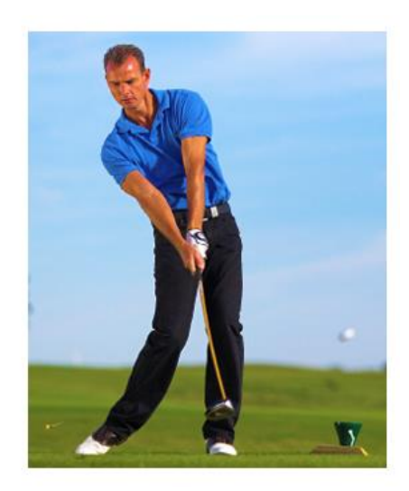
Each hole is a fresh start. But it can be ruined so quickly by a poor tee shot. Making sure you're playing your 2nd from a good lie further towards the hole, means it's probably going to be a fun hole.

How about having a conversation with us about what happens in your golf game? Can we find a single area of improvement that will quickly increase enjoyment and reduce frustration?