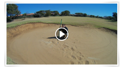
Raking your bunkers

They cannot do this alone. I would like to ask all our members to do their part. Something as simple as repairing a pitch mark or raking a bunker contribute to the world-class status our golf course, it is something I try do every day.