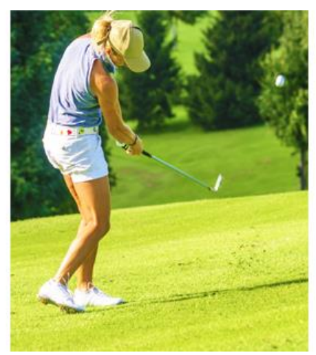
Skilled, low-handicap golfer. Good ball-striking skills.

That's wrong. An inexperienced, or less skilled golfer, who makes sure their equipment works for them, will actually see bigger benefits than the best golfers do.