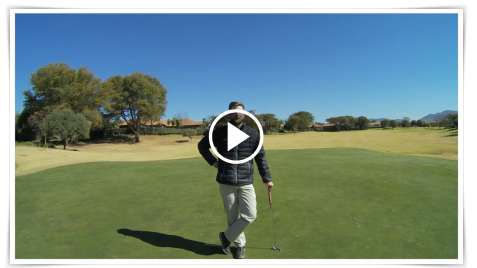
Repairing your pitch marks