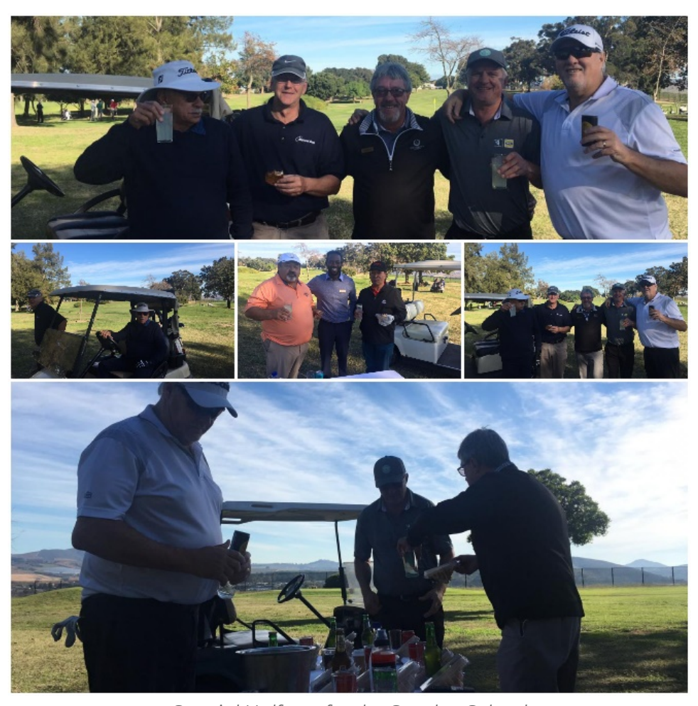
Special Halfway for the Sunday School