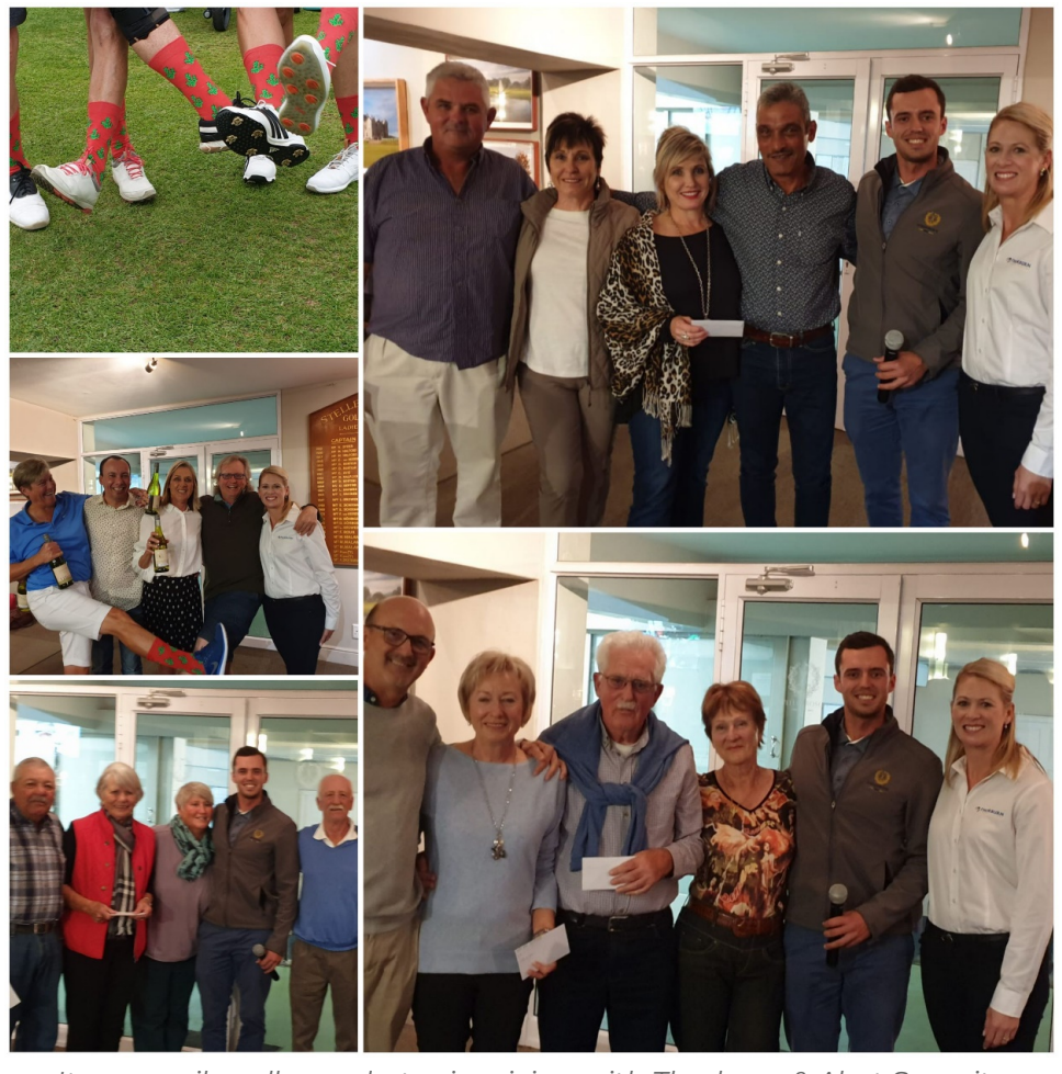
It was smiles all round at prizegiving with Thorburn & Alert Security spoiling the players