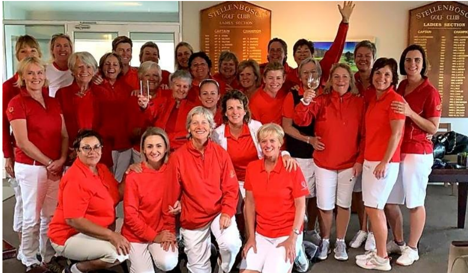
Stellenbosch winning ladies' team – go Girls!