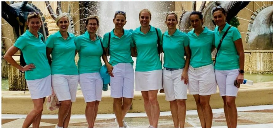
Pretty in in pink and green – love it!