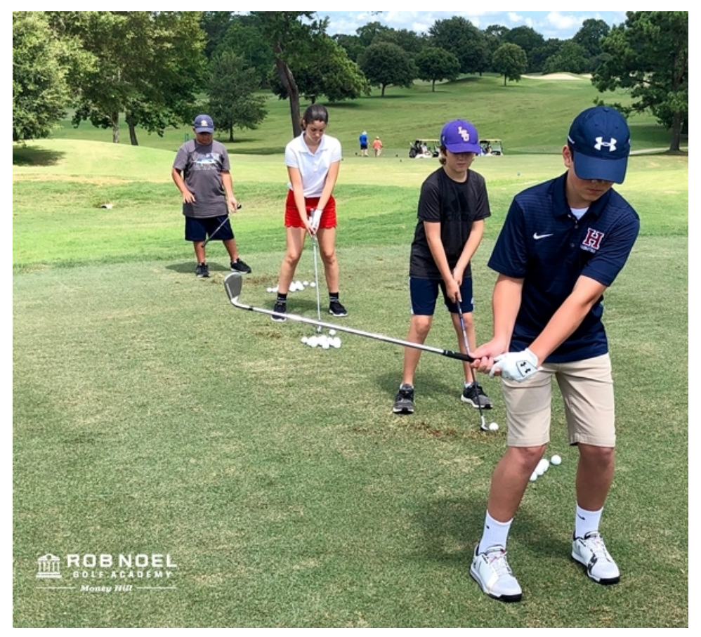
We worked hard on our Base of Support (BOS) - and finished up with smashing drives

Fuel your golfer's passion for the game and be a part of our comprehensive 12 week coaching program. We will guide your golfer through the fundamentals of swing technique, terminology, rules/etiquette, equipment, and skill development!