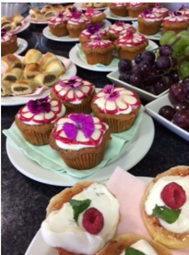
High tea menu delicacies

Our Bluetree café is the perfect place to enjoy a tasty meal in a relaxed environment. The terrace gives a wonderful view of the range. With the heat fast approaching Bluetree is perfect for laid-back afternoons in our shaded well-manicured gardens.