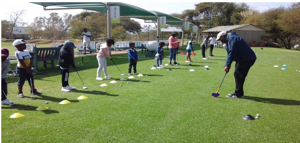
Fun golfing event for children