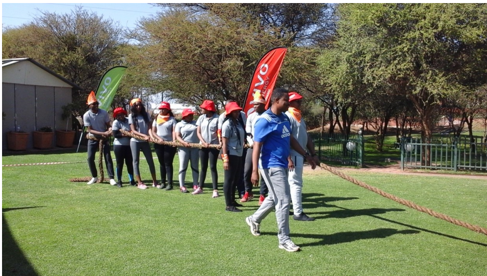
Vivo Energy staff on a wellness teambuilding session

Batho Pele, Men For Health And Gender Justice, Office Of The Presi, FNBB, BOCRA, PinnaLead, Botswana Life, Bomaid, Liberty Group, VIVO Energy, MARANG A BOKAMOSO, Forever Living, BIFM, DEBSWANA, BTC, Ministry of Health & Wellness, Ministry Of Employment, Labour Productivity And Skills Development, Ministry Of Mineral Resourc, Green Technology And Energy Security, De Beers Group, DTCB And National Development Bank.