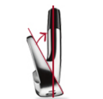
Loft (° Deg)