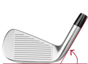
Lie angle (° Deg)

Whether it's about improving a handicap, shooting low scores, winning competitions, enjoying great shots, or fulfillment from the game, FITTING is the MUST HAVE .