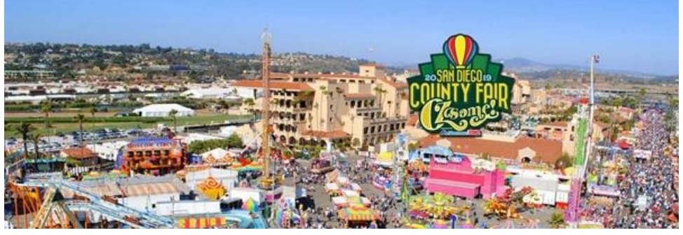
Click here for full schedule

With the fair there are some changes to our schedules: