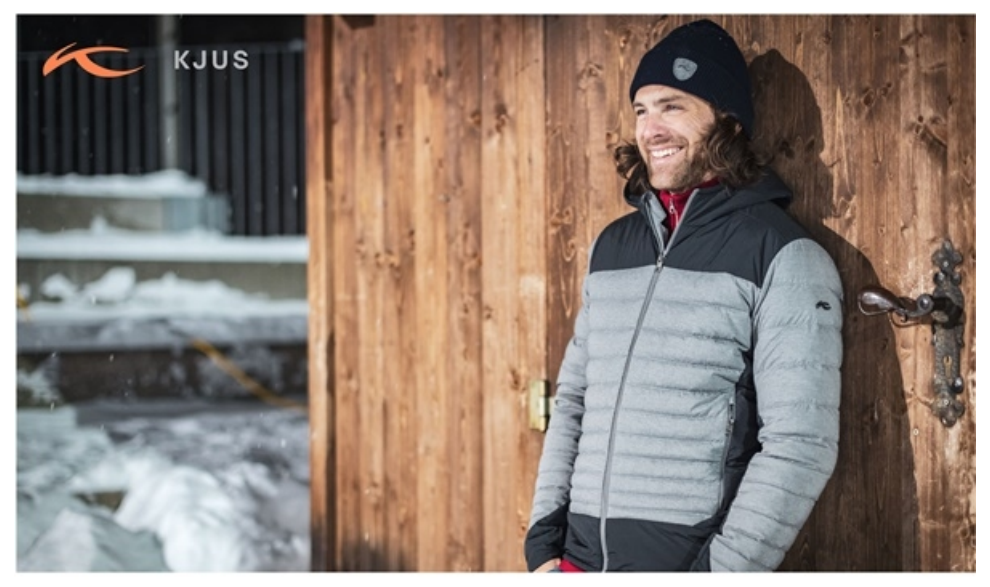
KJUS Ski and Lifestyle Trunk Show Saturday, November 23rd | 12pm - 6pm | Men's Pub

KJUS stands for sportswear made of innovative, high-performance material with a luxurious, clean design. KJUS apparel keeps your body climate balanced and protects you against extreme weather conditions.