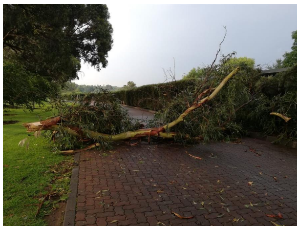
This tree went down across the access road in Monday afternoon's storm

things are looking up for the remainder of the season. Stuart also managed the course unbelievably well during the 2 heatwaves: the first one over Christmas and Boxing Day, and the other one which we're in right now!