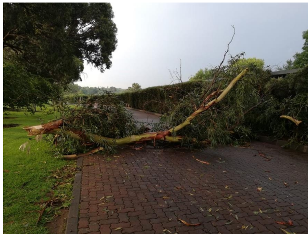
This tree went down across the access road in Monday afternoon's storm