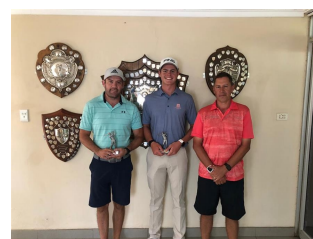
All three Division Champions