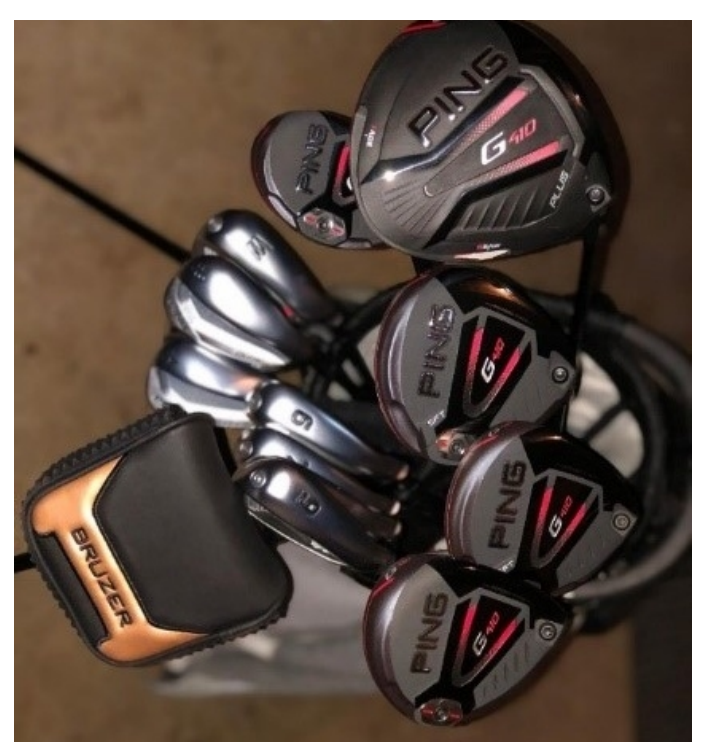
I present to you the PING G410 Series bag

I know what you're thinking: "You're with the best golf store in North Texas. You could have chosen virtually ANYTHING in the industry. Why did you go back to PING?"