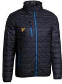
Cutter & Buck Stealth Half Zip