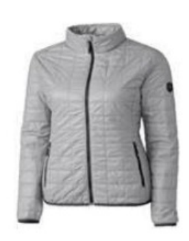
Cutter & Buck Melange Rainier Vest/Jackets