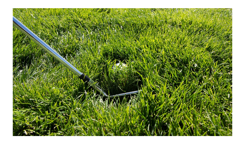
To practice these and more expert tips, book a lesson with us . You won't regret it!

When the grass is against you in the rough (growing away from the target), put a firmer grip on the club, swing harder on pitches, and add at least one club for long shots. When the grass is growing toward the target (a flyer), swing easier around the greens and take at least one less club for full shots using your normal grip pressure.