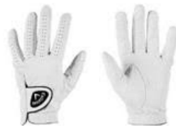
Buy two Callaway Dawn patrol leather gloves for only R349-00. Only from 4-6 July