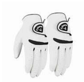
Callaway weather span gloves Buy 2 for only R 200

Get a better grip on your game with the right golf glove.