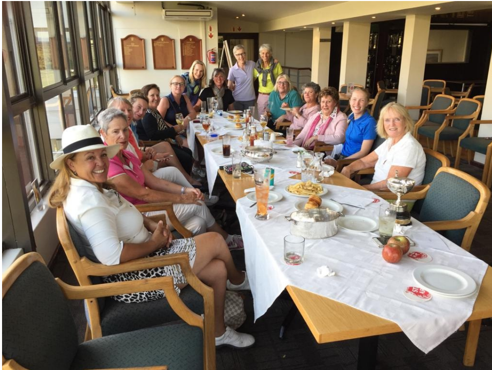
Some of our favourite ladies having a ball!

What an amazing turn out for the ladies on Tuesday!