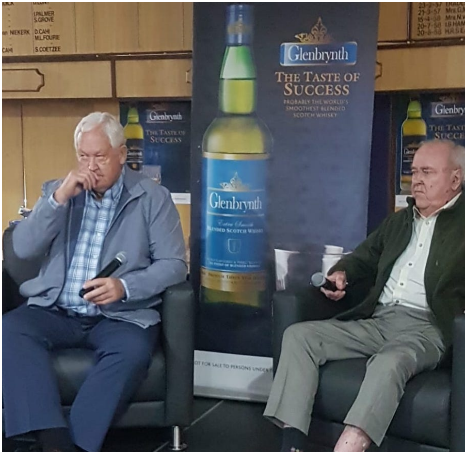
Hutch & I answering questions