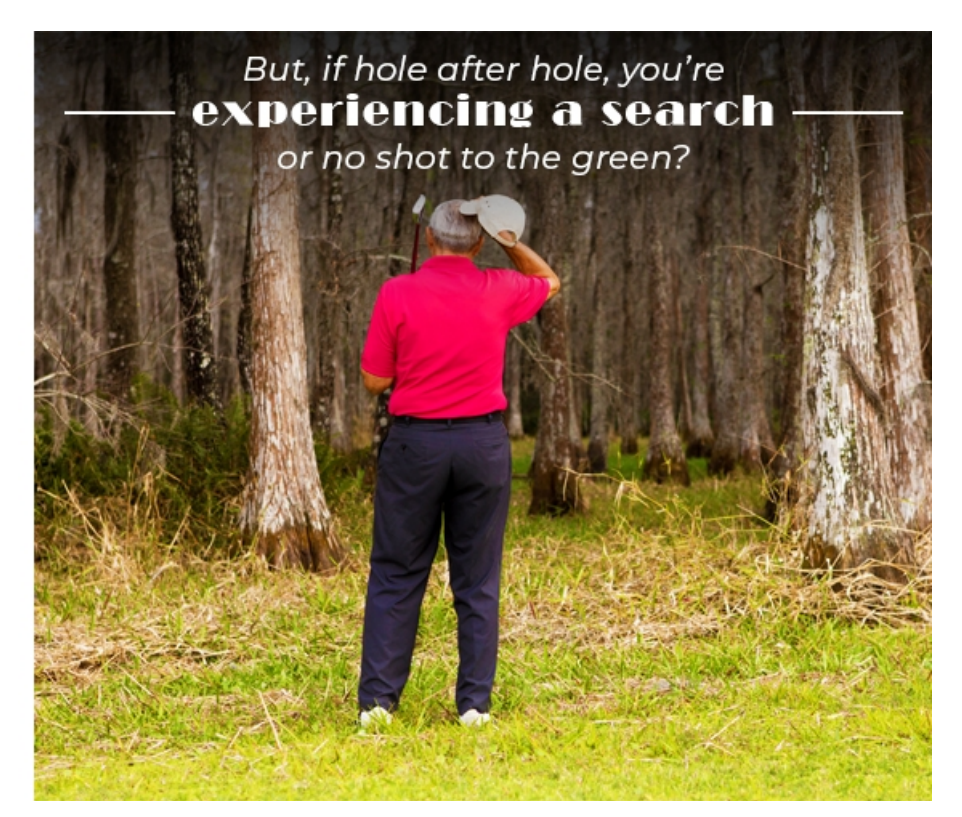
If hole after hole, you're hitting fairway after fairway how great is the game?

It's not so much that you've found the fairway that's enjoyable (although it is). It's the fact that you've set up an approach shot to the green and it's now all about opportunity and not recovery.